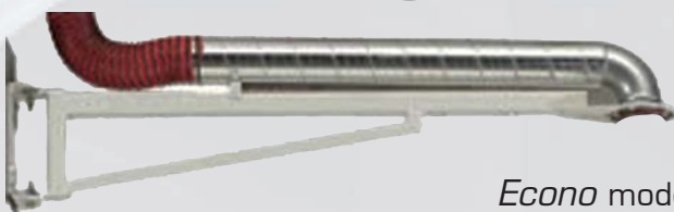
Econo model for budget applications

Note : Eurovac reserves the right to modify the equipment without notice in order to improve quality or conception.