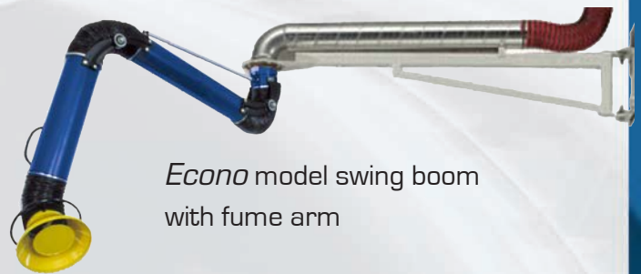
Econo model swing boom with fume arm