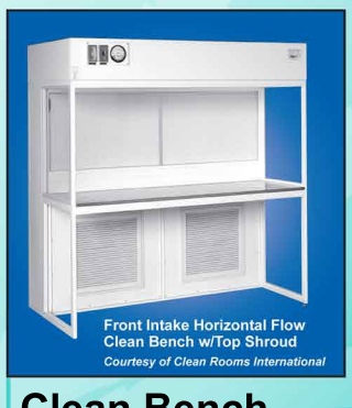
Clean Bench w/HEPA Filter

The sales professionals at IAS have been in the air filtration business for 30-years and can help you with particulate and odour control issues in your medical cannabis facility.