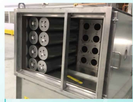
HEGA (Carbon) Canister Odor-Control Unit

HVAC filter systems with Carbon (HEGA), HEPA filters, or both. Fans, VFD's, skid-base are just some of the options available.