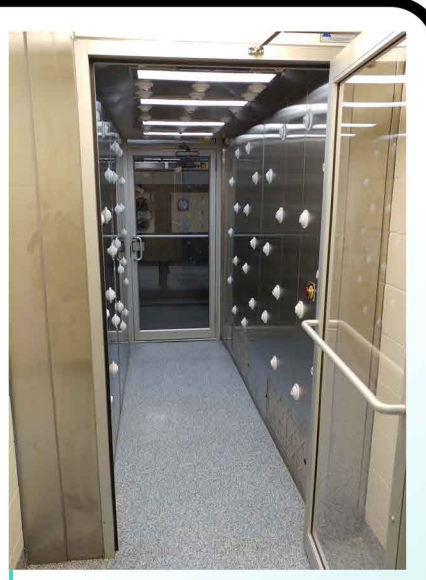
Air Shower Tunnel

Air Showers & Tunnels of various configurations and sizes to minimize particulates and cross-contamination.