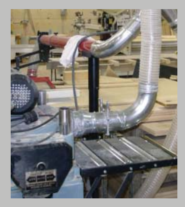
Typical applications include welding fumes and stationary equipment