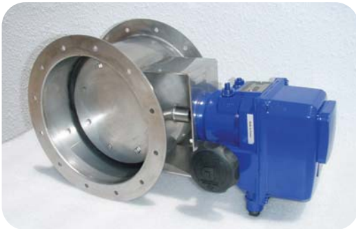
ELECTRIC ACTUATOR W/MANUAL OVERRIDE